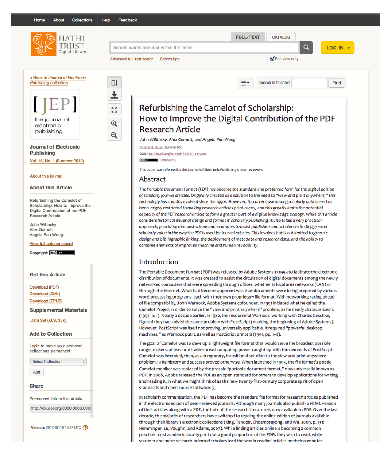
Figure 2: Mockup of an article viewed in HathiTrust's user interface

originally designed to support reformatted print materials. The reading interface in HathiTrust, which previously supported only rendering of digitized page images, renders JATS XML in HTML and allows a user to download a dynamically generated PDF and EPUB, display metadata specific to articles (figure 2), and link to a special "collection" for the journal in HathiTrust's Collections application [17] that allows for browsing volumes and issues of the journal (figure 3).